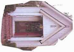
Richter Chapel constructed in the early 1990's

Trail Description: Concrete and asphalt thru downtown and historic residential areas.