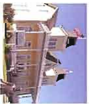
Cullman County Museum Cullmancountymuseum.com